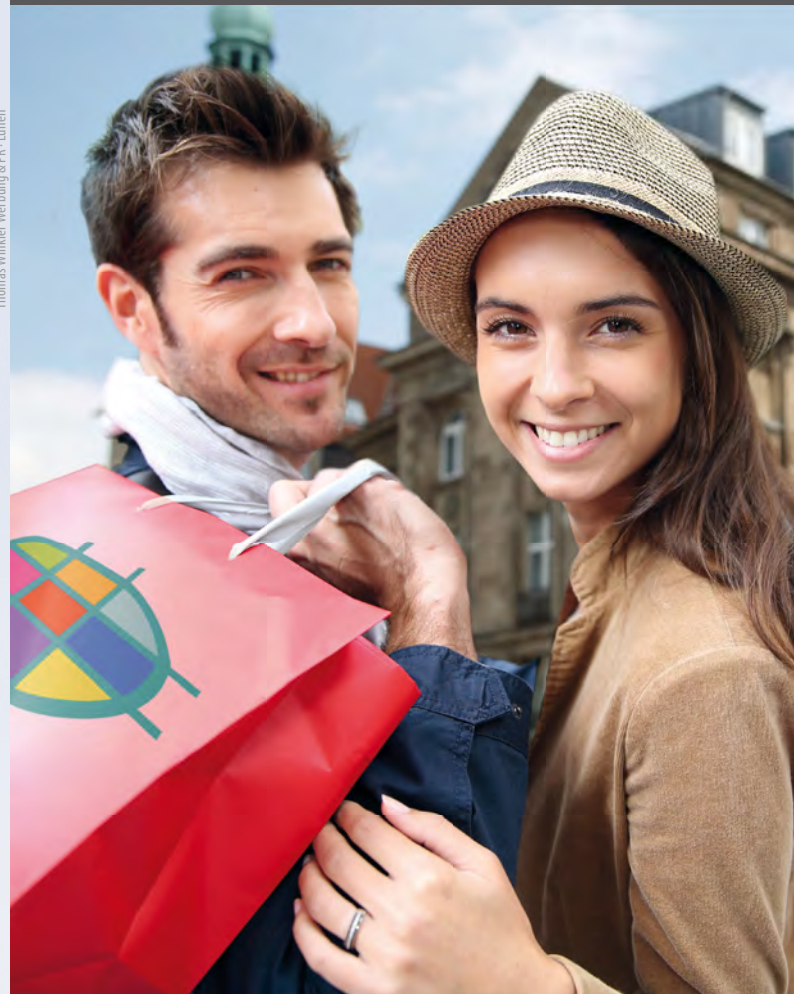
Thomas Winkler Werbung & PR - Lünen